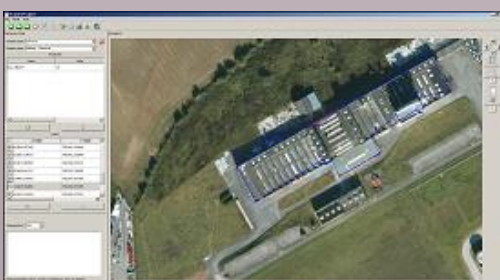
Planimetric features edition