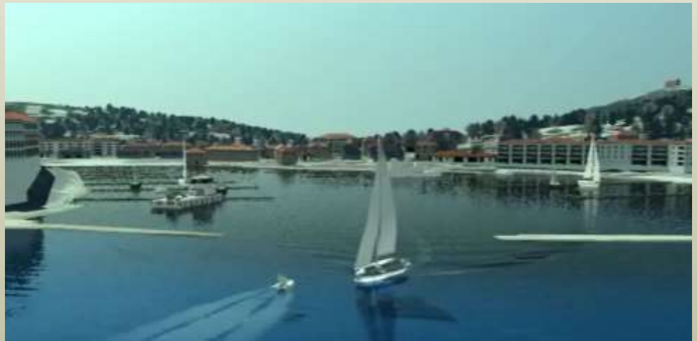
SE-RAY-IR (OTW) spectral image