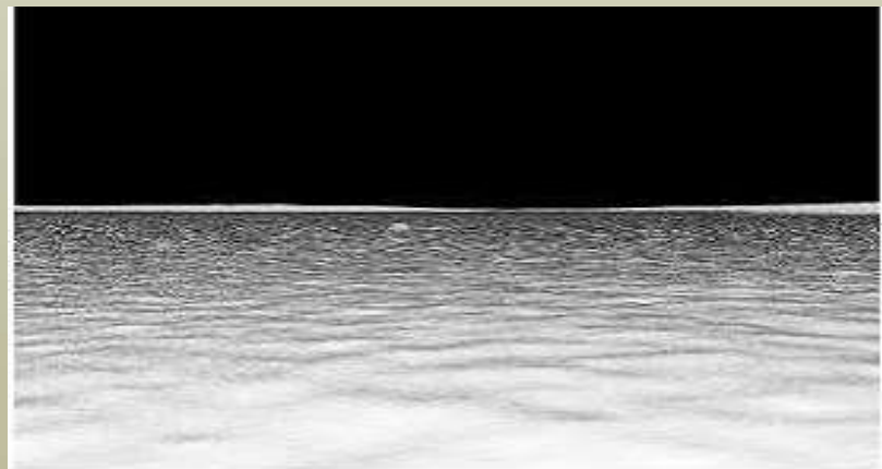
SE-RAY-IR – Sea surface SWIR rendering

Water material is considered as a dielectric spectral material. It uses smooth dielectric materials of finite width. The model takes into account the variation of the water depth using bathymetry data.